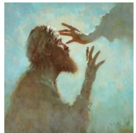
Master, grant that I may see