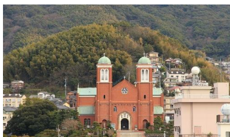
Cathedral rebuilt 1950s