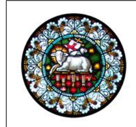
The Lamb of God, slain yet living