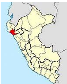
Peru – Chiclayo Diocese

As a Religious Superior, a Bishop and a Cardinal he draws praise on handling sex abuse — and some allegations, also refuted, of mishandling cases. (PHMSC – various sources)