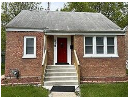
The Prevost's home in Chicago.

1969 - 1973 attended Augustinian Friars' Minor Seminary High School. 1977, entered the Augustinian's Novitiate. 1982 ordained priest for the Augustinian Order in Rome.