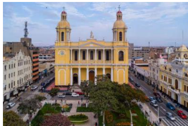
St. Mary's Cathedral in Chiclayo, Peru, where Prevost was diocesan bishop from 2015 to 2023.