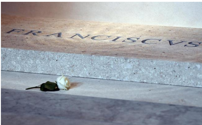
Pope Francis Tomb, Mary Major Basilica

With 135 cardinal electors the 2025 papal conclave after Pope Francis will be the largest conclave in the Church's history. A two-thirds supermajority vote is required to elect the new pope.