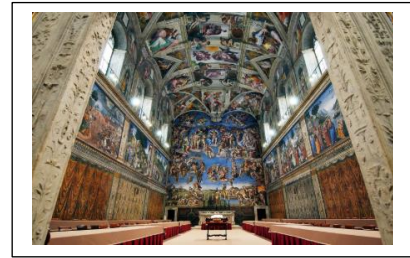
Sistine Chapel set up for the Conclave