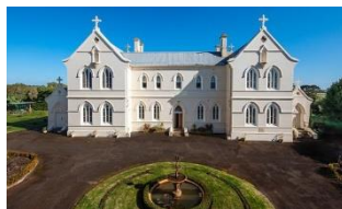
“Good Sams” Convent, Koroit. (Now, unfortunately, a restaurant.)