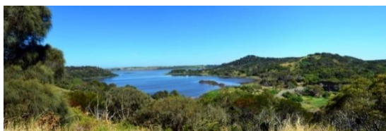
Tower Hill, Volcano along the rim of which Koroit is built.