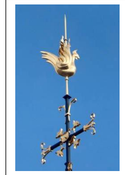
Notre-Dame Paris Rooster

Whenever a person thinks, questions and reflects on his or her true identity ... it leads to the realization that our fulfilment as human beings is found in love. In loving, we sense that we come to know the purpose and goal of our existence in this world ”. [c.f. The text and phone messages of people caught in the Twin Towers tragedy in New York – unfiltered words from the Heart...words of love and forgiveness, of the anguish of separation, of reconciliation where needed, of thoughtfulness and watchfulness from heaven.] “Everything comes together in a state of coherence and harmony. It follows that, in contemplating the meaning of our lives, perhaps the most decisive question we can ask is, “Do I have a heart?” Pope Francis. “He loved us” - Encyclical on the Sacred Heart