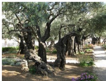
Gethsemane Olive Grove on the hill overlooking the Temple and city of Jerusalem.

Also of interest: in the Garden beside the Parish Office at OLSH Church Randwick there are three olive trees – the middle one was struck from a cutting of an olive tree in Gethsemane , and planted by, of all people, the then Mayor Randwick in the 1960s. (BTW not an invitation to “garden” there.) How it passed import restrictions on plant matter is an unknown – perhaps in the 1960s things were not so strict? From memory all three produce olives - but none are refined, at least not by the busy clergy of Randwick, who even if they had the time would not know what to do 😊.