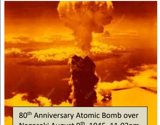
80 th Anniversary Atomic Bomb over Nagasaki August 9 th , 1945, 11.02am