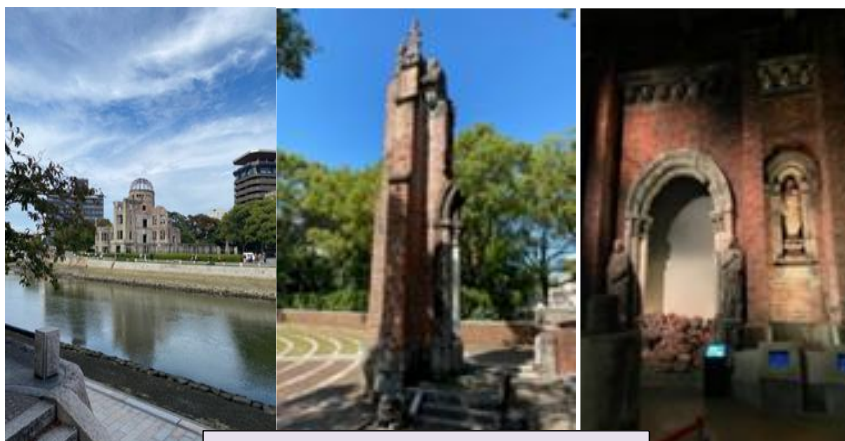
Nagasaki Hypocentre & Cathedral