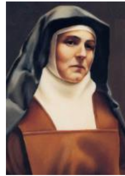
Teresa Benedicta of the Cross