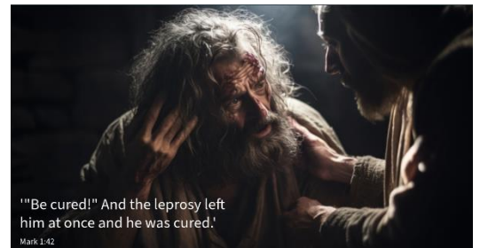
"Be cured!" And the leprosy left him at once and he was cured. Mark 1:42